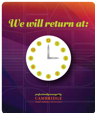
11.75" x 14" .125 ACRYLIC w/HANGING SUCTION CUP