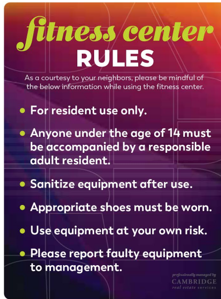
18" x 24" .063 ALUMINUM