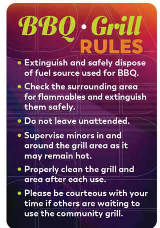
12" x 18" .063 ALUMINUM