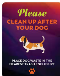
8" x 10" 3mm DIBOND