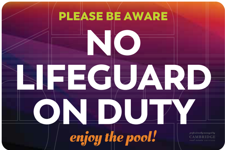
24" x 36" .08 ALUMINUM