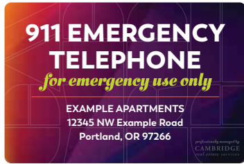
18" x 12" .063 ALUMINUM